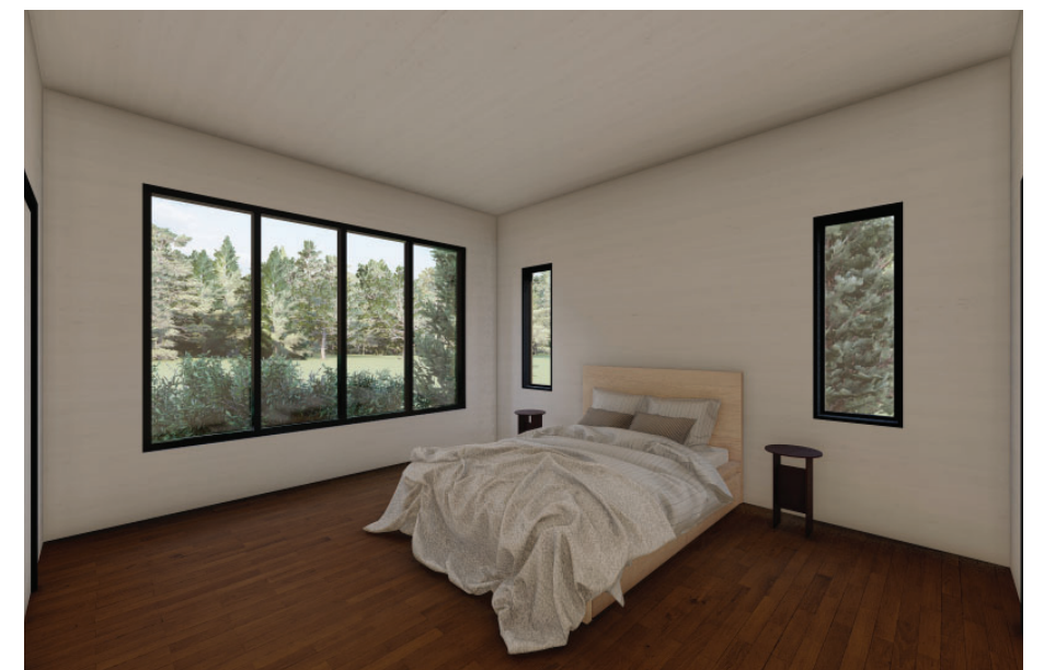
Architecture and landscape renderings do not reflect finished selections